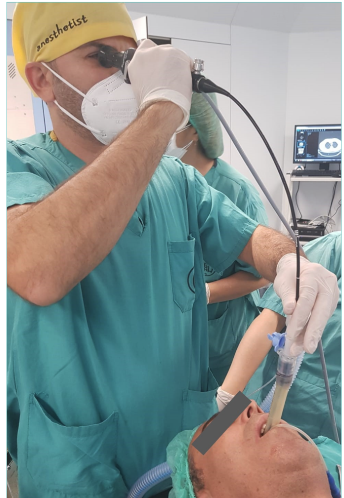
Figure 2. A fiberoptic bronchoscopy guided gum elastic bougie insertion through the laryngeal mask airway in a case of difficult double lumen tube intubation